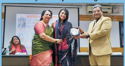
International Women's Day Celebration